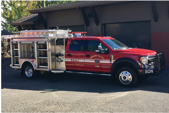
This new Type 6 fire engine is built specifically for remote mountains and was paid for by the MVFD community.